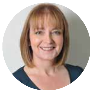
Dr Nuala O Connor

What role does antimicrobial stewardship play in tackling antimicrobial resistance?