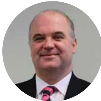
Dr Tony Holohan

We must act now, however a great deal has already been done. The control of healthcare associated infections and AMR has been a policy priority for the Department of Health and the health system for