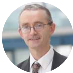
Professor Martin Cormican

M aking sure antibiotics are used in the right way for people and animals who need them, and are not used where they are likely to do more harm than good, is critical to dealing with antimicrobial resistance. Antimicrobial stewardship is one way to do this – but it is of limited value. What is needed is a national system of restrictive prescribing supported by effective clinical governance. Electronic prescribing and monitoring makes this much easier to do. Restrictive prescribing should mean only a limited range of agents are available to most prescribers and other antimicrobials are used only by an infection specialist (microbiologist, infectious disease physician, specialist veterinarian). Those authorised to prescribe these agents need to be part of a system of standardisation and peer review.